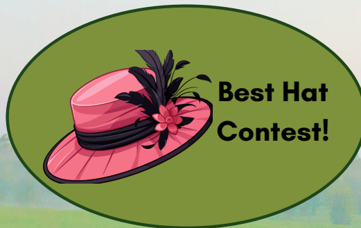
Best Hat Contest!