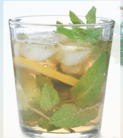
Mint Juleps $6

Kentucky Hot Brown Sandwich with side $10