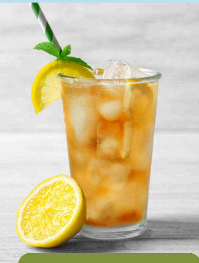
Spiked Iced Tea $6

Louisville Pulled Pork Sandwich with side $10